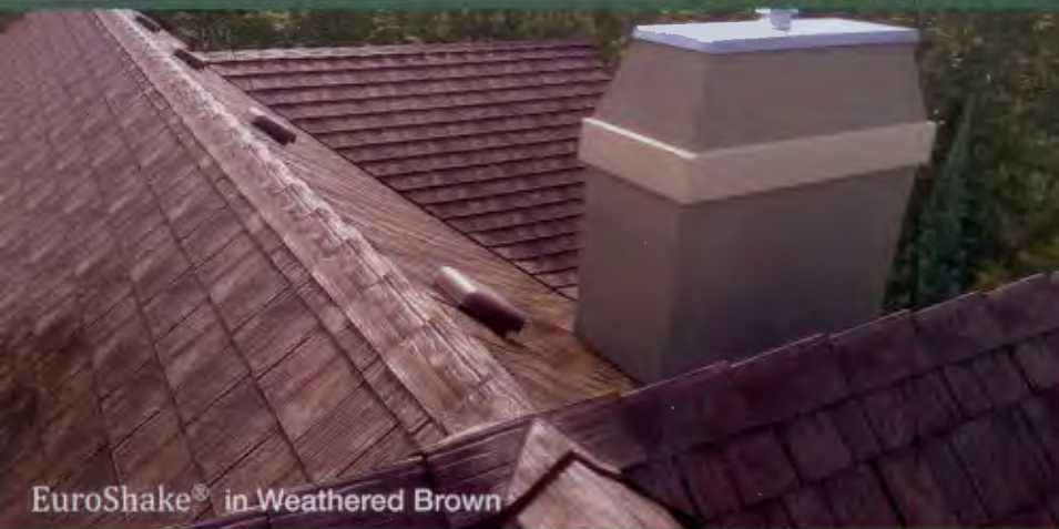
EuroShake® in Weathered Brown

EUROSHIELD® manufactures 2 Slate profiles... EuroSlate® and Heritage Slate.