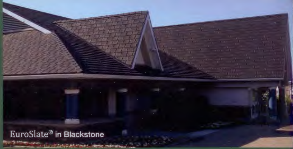
EuroSlate® in Blackstone

EUROSHIELD® Rubber Roofing products were created over 16 years ago with the goal of diverting and recycling the tremendous deluge of used tires ultimately destined for landfill. Years of research and development led to the creation of a unique formula, containing 70% recycled tire rubber and approximately 95% recycled content, for the production of the finest rubber roofing products available on the market today.