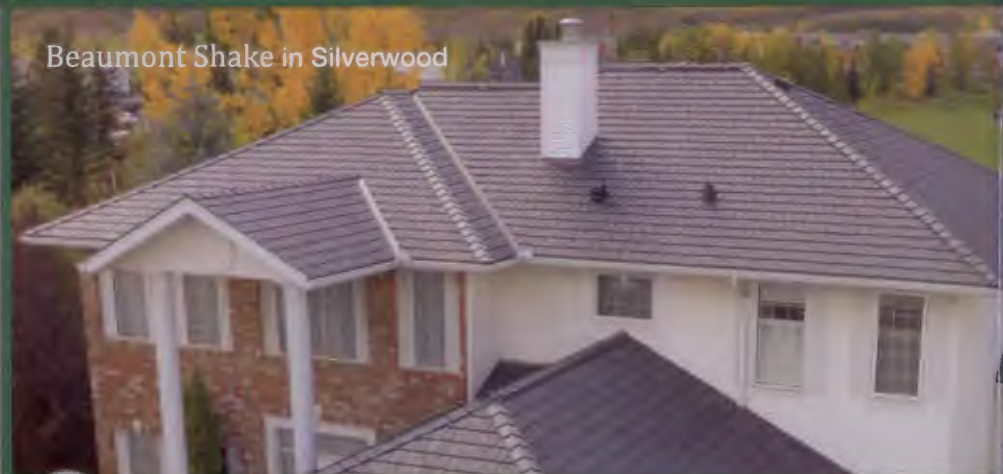
Beaumont Shake in Silverwood

EuroSlate® and EuroShake® are the original rubber roofing products and feature our unique interlocking "tongue and groove" panel system. They present a thicker profile (3/4" at the butt edge) and weigh approximately 3.4 lbs per square foot. Light enough for any standard roofing application without the need for added truss supports. EuroShake® offers both Taper-Sawn and Hand-Split look versions. Heritage Slate, Beaumont Shake and Harvest Shake offer the same great looks and performance in a thinner profile, approximately 1/2" at the butt edge, at a much lower cost, typically between asphalt shingles and other premium metal, cedar and plastic composites.