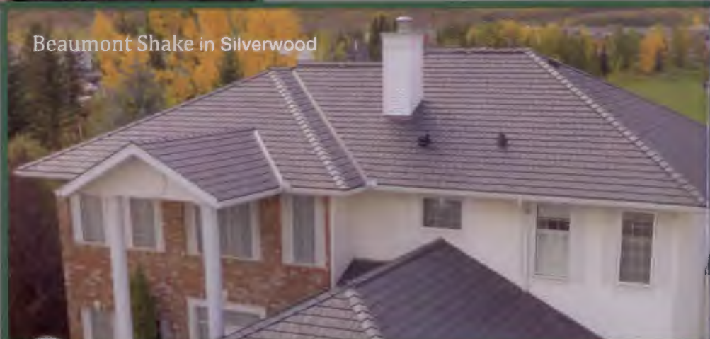
Beaumont Shake in Silverwood

EuroSlate® and EuroShake® are the original rubber roofing products and feature our unique interlocking "tongue and groove" panel system. They present a thicker profile (3/4" at the butt edge) and weigh approximately 3.4 lbs per square foot. Light enough for any standard roofing application without the need for added truss supports. EuroShake® offers both Taper-Sawn and Hand-Split look versions. Heritage Slate, Beaumont Shake and Harvest Shake offer the same great looks and performance in a thinner profile, approximately 1/2" at the butt edge, at a much lower cost, typically between asphalt shingles and other premium metal, cedar and plastic composites.